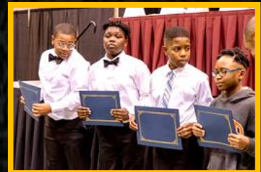
ORL Educational Foundation's 7 th Grade Essay Scholarship Recipients (4)