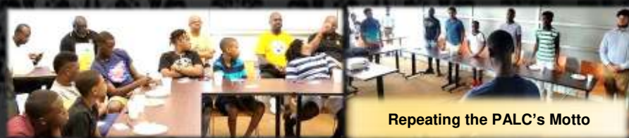
Repeating the PALC's Motto