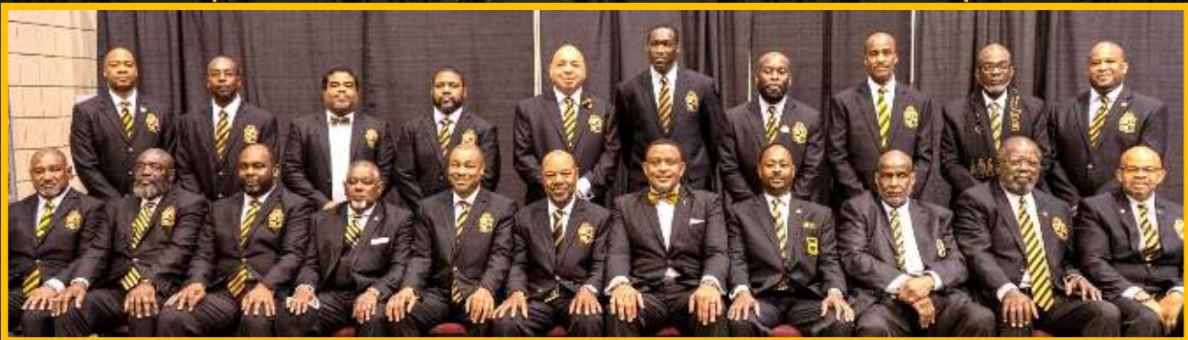
Brothers of Omicron Rho Lambda Chapter are joined by the 11 th Mississippi District Director and the Mississippi Executive Director