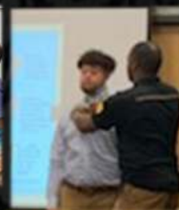
How to Tie a Bow Tie