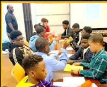
Leadership/Teambuilding Exercise (STEM Challenge) - Seven Groups