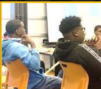
Alpha men ready to mentor and share knowledge

January's storyboard includes pictures from the Project Alpha Leadership Club's (PALC) meeting on Saturday, January 4, 2020.