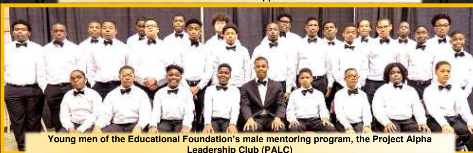
Young men of the Educational Foundation's male mentoring program, the Project Alpha Leadership Club (PALC)