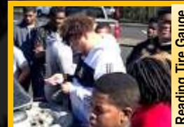
Reading Tire Gauge