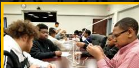
Teambuilding Exercise (STEM Challenge): Straw Tower