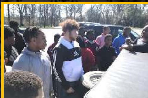
Life Skills: Car Care – Checking tires for proper inflation